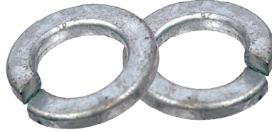
HOT DIP GALVANIZED